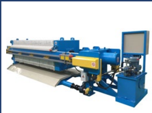
ROBUST, EFFICIENT FILTER PRESSES